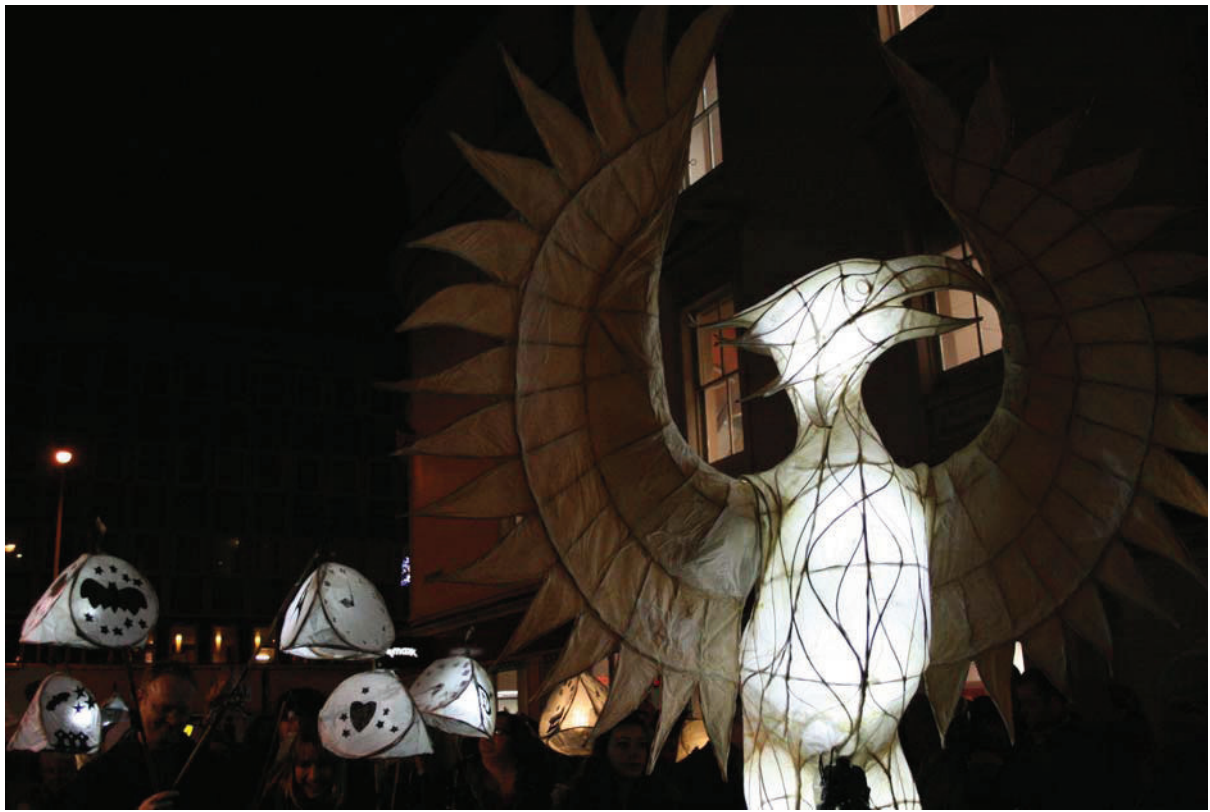
Burning the Clocks, 2011 - Bec Britain